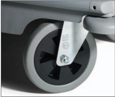
Large 200mm Super-Quiet Wheels