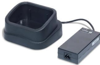
Off board charging