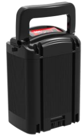
Configure your battery requirements