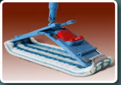
The new NyloTwin 40, two mops in one!