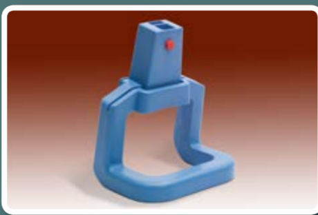
Flat Mop Stand Neat and Tidy.