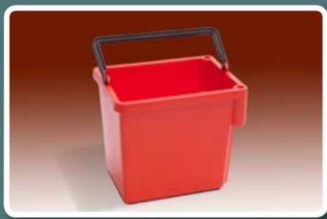
5L Swing Pail There when you need it.