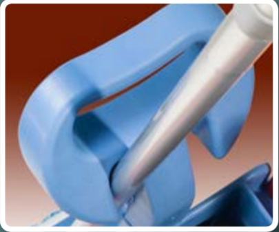
Optional mop handle system