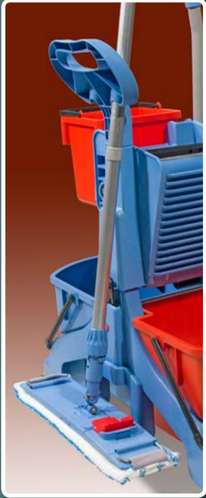
Optional on-board mop storage stand