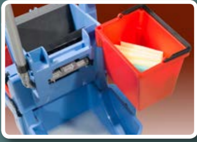
Optional 5L Swing Pail