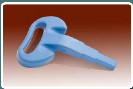
Top Handle Convenience plus.