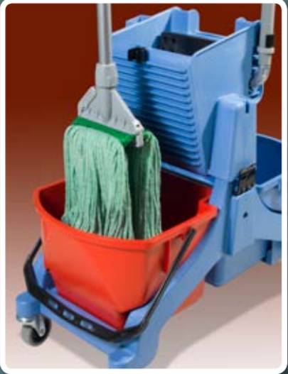
Suitable for Kentucky 450g or 40cm Flat mops with full access to both buckets