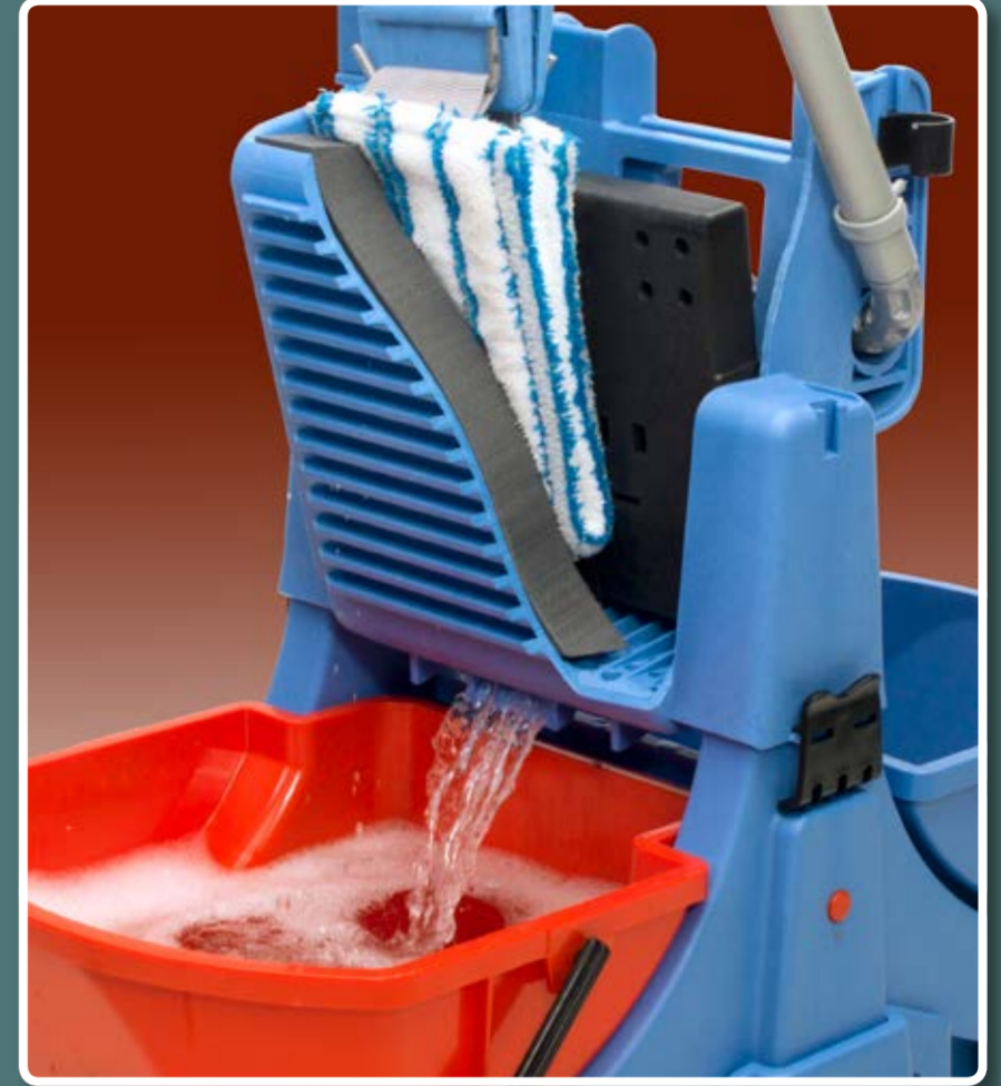
Patented water discharge diverter

Suitable for Kentucky or Flat mops the Midmop is ready to work. Access to both buckets is easy whichever mop you choose to use. A range of accessories allow the user to create a Midmop unit that precisely suits the environment to be cleaned.