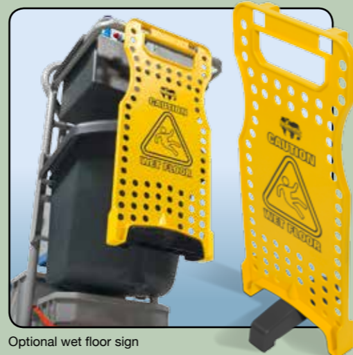
Optional wet floor sign