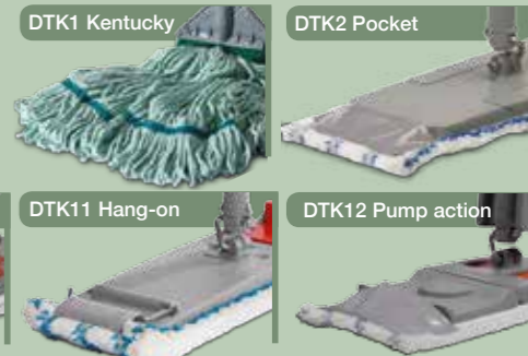
See pages 28-29 for full mop kits, holders and mops