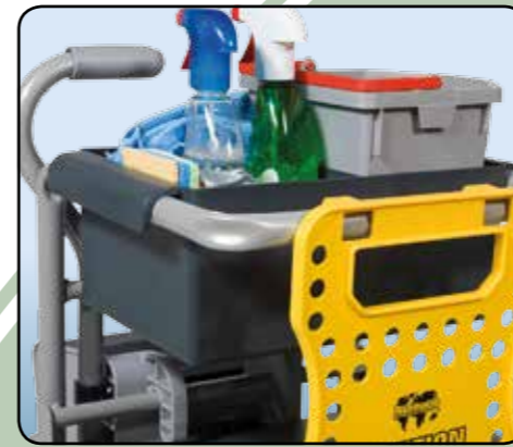
Optional larger tray and pail