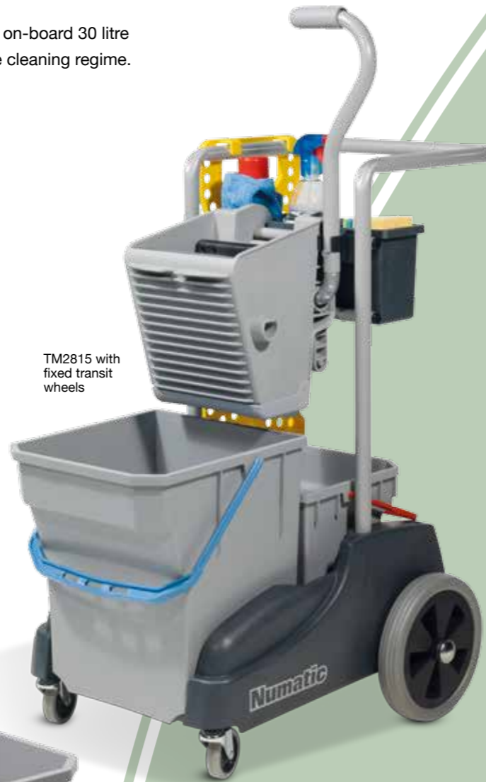
TM2815 with fixed transit wheels