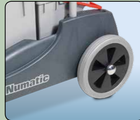
Optional All-Terrain fixed transit wheels