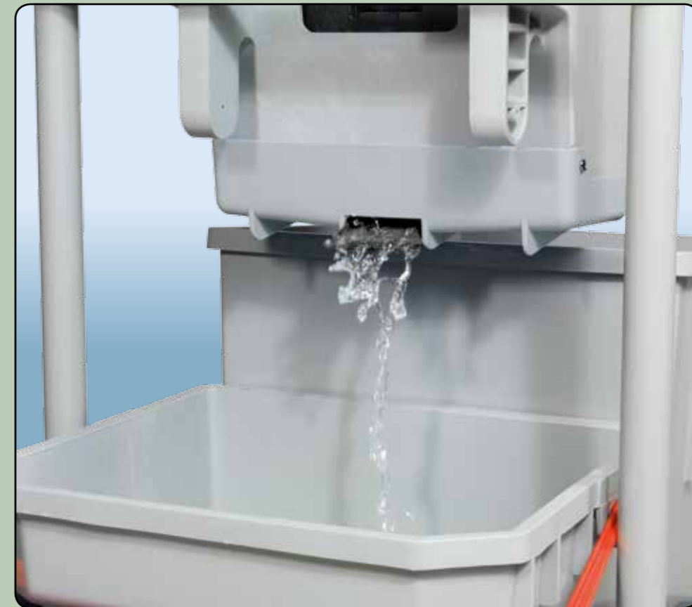
AWS - Automatic Water Separation