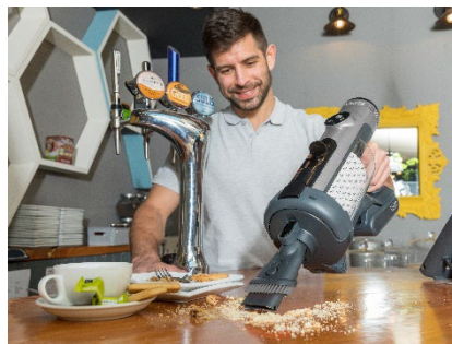
Handy 2-in-1 Combi Tool